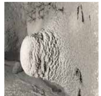
Application of shotcrete - Sialfrax™ Shot