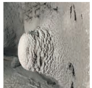
Application of shotcrete - Sialfrax™ Shot