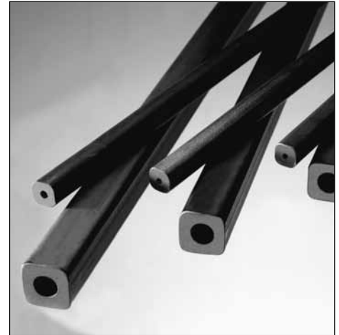
Hexoloy® SE SiC Beams

Hexoloy SiC is one of the hardest high performance materials available and is 50% harder than tungsten carbide. Its density is in excess of 95% of theoretical and it is completely impervious without the use of any impregnants, which means no contamination in high purity applications.